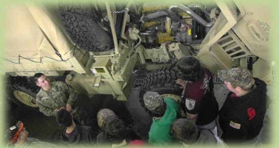
ACC Automotive students listen to an explanation of the features of a U.S Army transport vehicle.